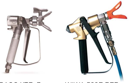
GRACO XTR-7 airless spraying gun

NOTE: All filters in the spraying gun must be removed!