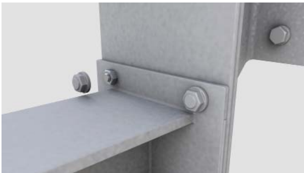
Assembly of bolt caps

Further information can be found in our flyer and on our website www.rudolf-hensel.de/920KS