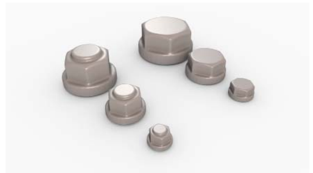
Screw nuts / Screw heads